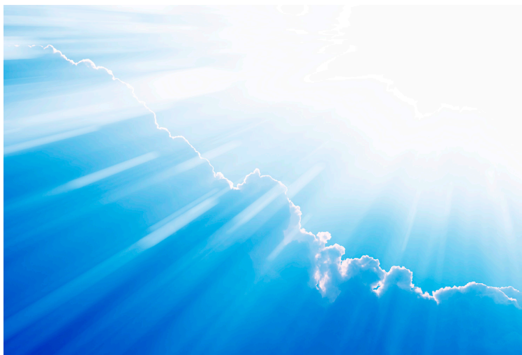
Second Coming of Christ Will Be Seen Worldwide

occur. Matthew 24:4-31 provides the timeline from the Ascension of Christ to the Second Coming of Christ. This passage has been explained in the previous three studies. The first two verses of our study are Matthew 24:29-30. They reveal that the second coming will occur at the end of the tribulation. Verses 29-30 say,