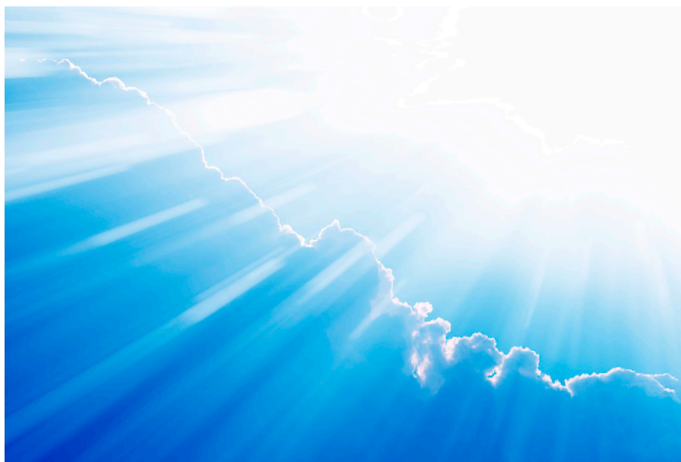
Second Coming of Christ Will Be Seen Worldwide

occur. Matthew 24:4-31 provides the timeline from the Ascension of Christ to the Second Coming of Christ. This passage has been explained in the previous three studies. The first two verses of our study are Matthew 24:29-30. They reveal that the second coming will occur at the end of the tribulation. Verses 29-30 say,