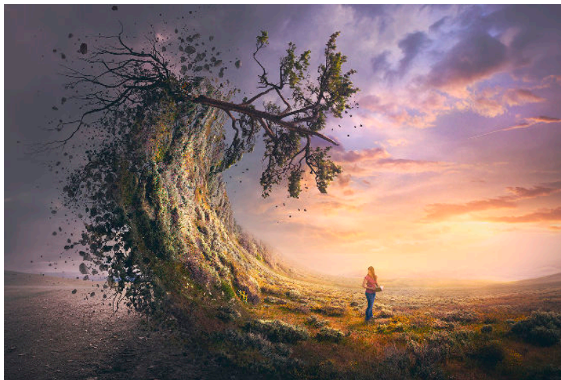
Great Tribulation Will Be God's Wrath Upon this Evil World

Overview of the Signs. In the last two studies, “would His second coming occur?” He will answer that Christ has been with Peter, Andrew, James, and John on the Mount of Olives. He was answering the second of two questions that they had asked. The question was, “What are the signs of His second coming?” (Matthew 24:4). Verses 29-31 will provide the answer to their first question which was, “When