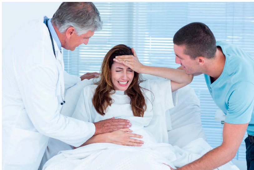
Woman Experiencing Very Strong Birth Pangs

As He was sitting on the Mount of Olives, the disciples came to Him privately, saying, “Tell us, when will these things happen, and what will be the sign of Your coming, and of the end of the age?” Matthew 24:3 (NASB)