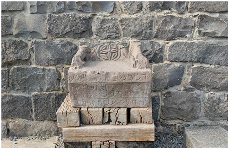
Seat of Moses In the Synagogue of Chorazin.

They tie up heavy burdens and lay them on men’s shoulders, but they themselves are unwilling to move