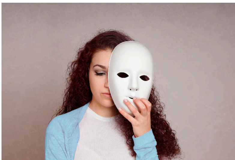
Pretending To Be Spiritual

“No one was able to answer Him a word, nor did anyone dare from that day on to ask Him another question.” Matthew 22:46 (NASB)