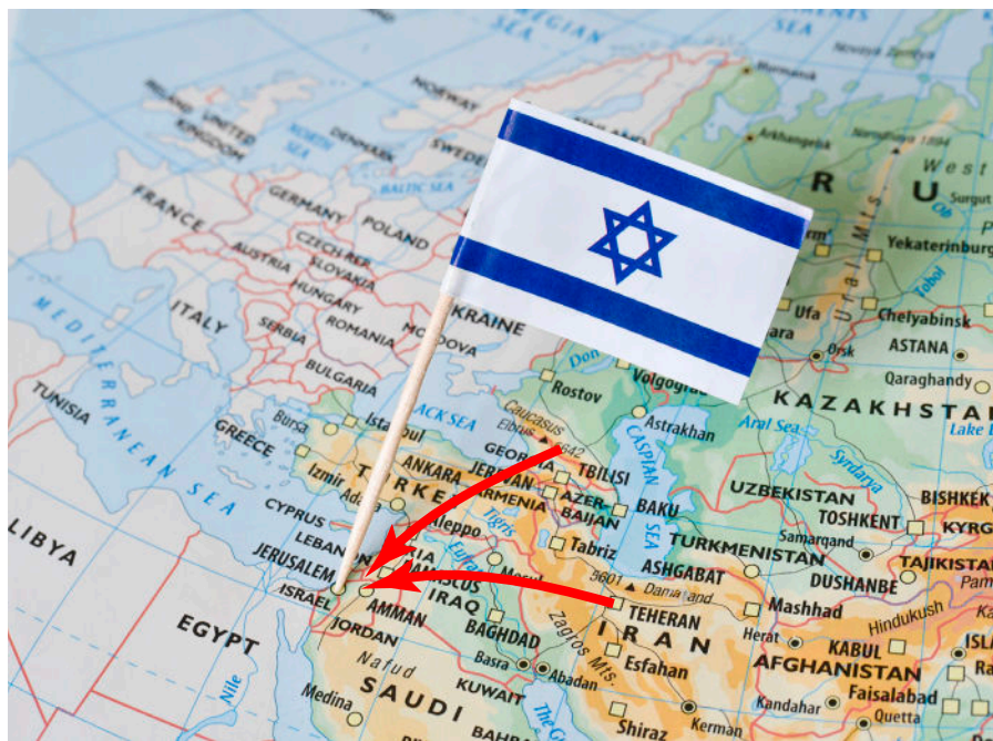
Battle of Gog and Magog – Ezekiel 38:1-23

This suggests that the land of Magog once existed, but now no nation is named Magog. So, to which countries did Magog's descendants scatter? The ancient records of Flavius Josephus help us because he said Magog's descendants were the Scythians. The church