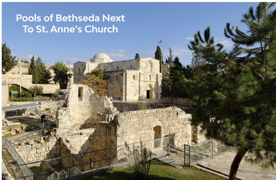
Pools of Bethesda Next To St. Anne's Church

Now there is in Jerusalem by the sheep gate a pool, which is called in Hebrew