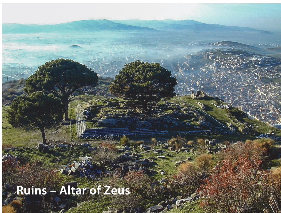
Ruins – Altar of Zeus