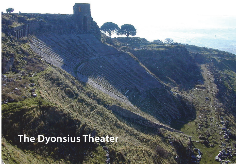
The Dyonsius Theater

THE REWARDS. Then Jesus ends on a positive note. He always does in these messages of warning! Verse 17 is a promise of reward for every Christian.