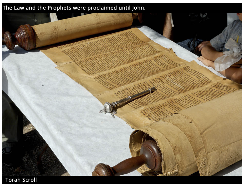
The Law and the Prophets were proclaimed until John.