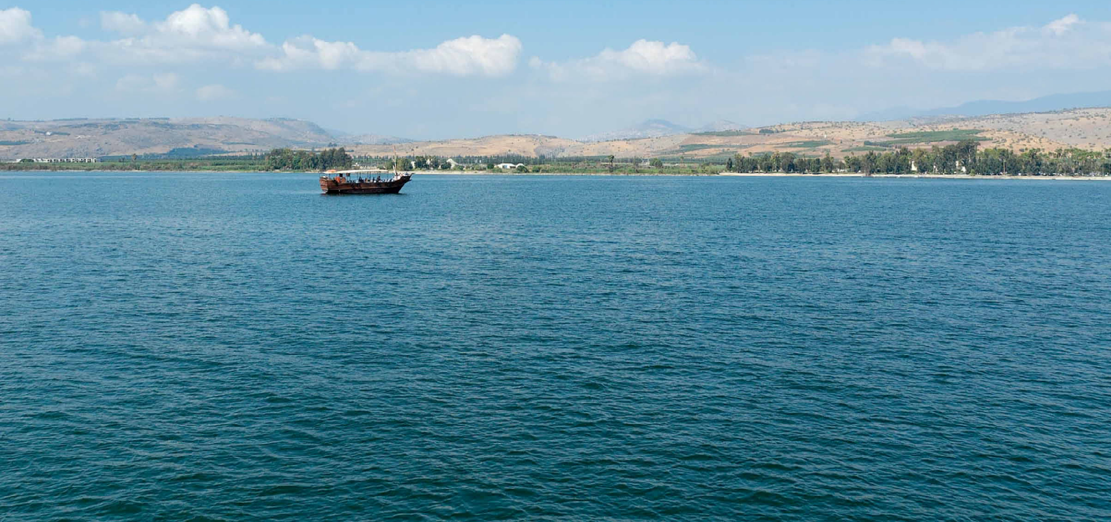
Sea of Galilee with boat

He made His disciples get into a boat and go ahead of Him to the other side, to Bethsaida