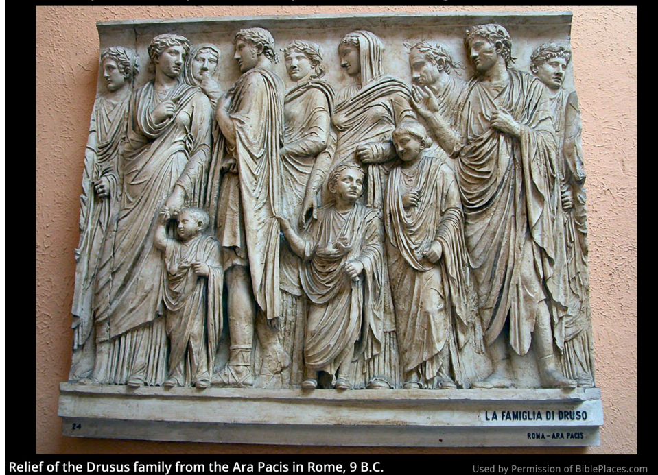
Relief of the Drusus family from the Ara Pacis in Rome, 9 B.C.

Do not invite your friends or your brothers or your relatives or rich neighbors . . . Luke 14:12