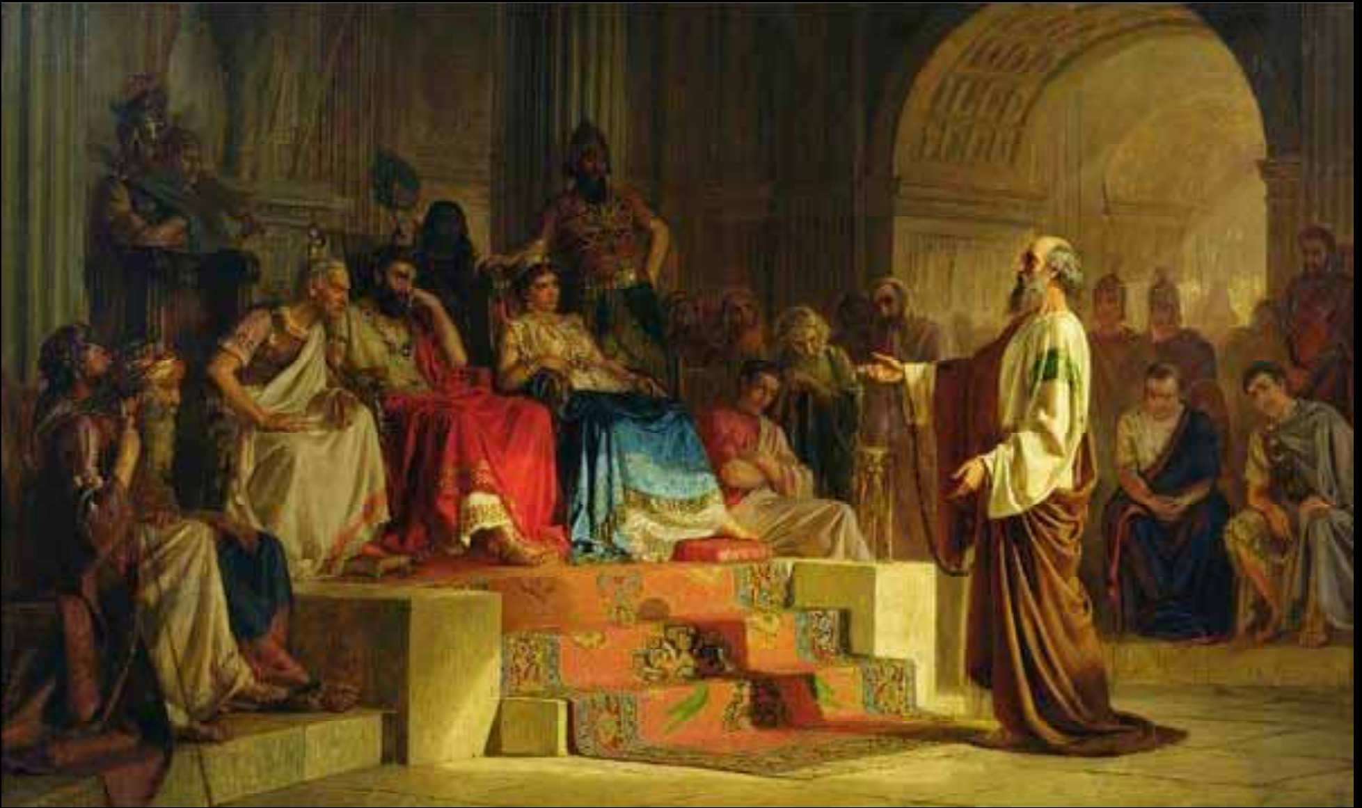
Paul Before King Agrippa Acts 26:1-29