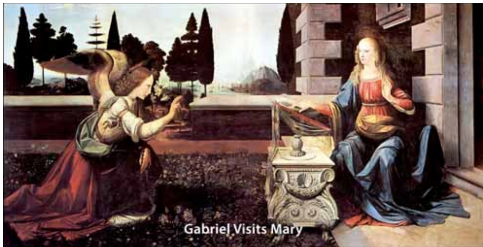
Gabriel Visits Mary

No, that is not that the way it happened. The angel just showed up and said, "Mary, you are going to get pregnant. No choice! That's it, that's the plan. In your womb you will