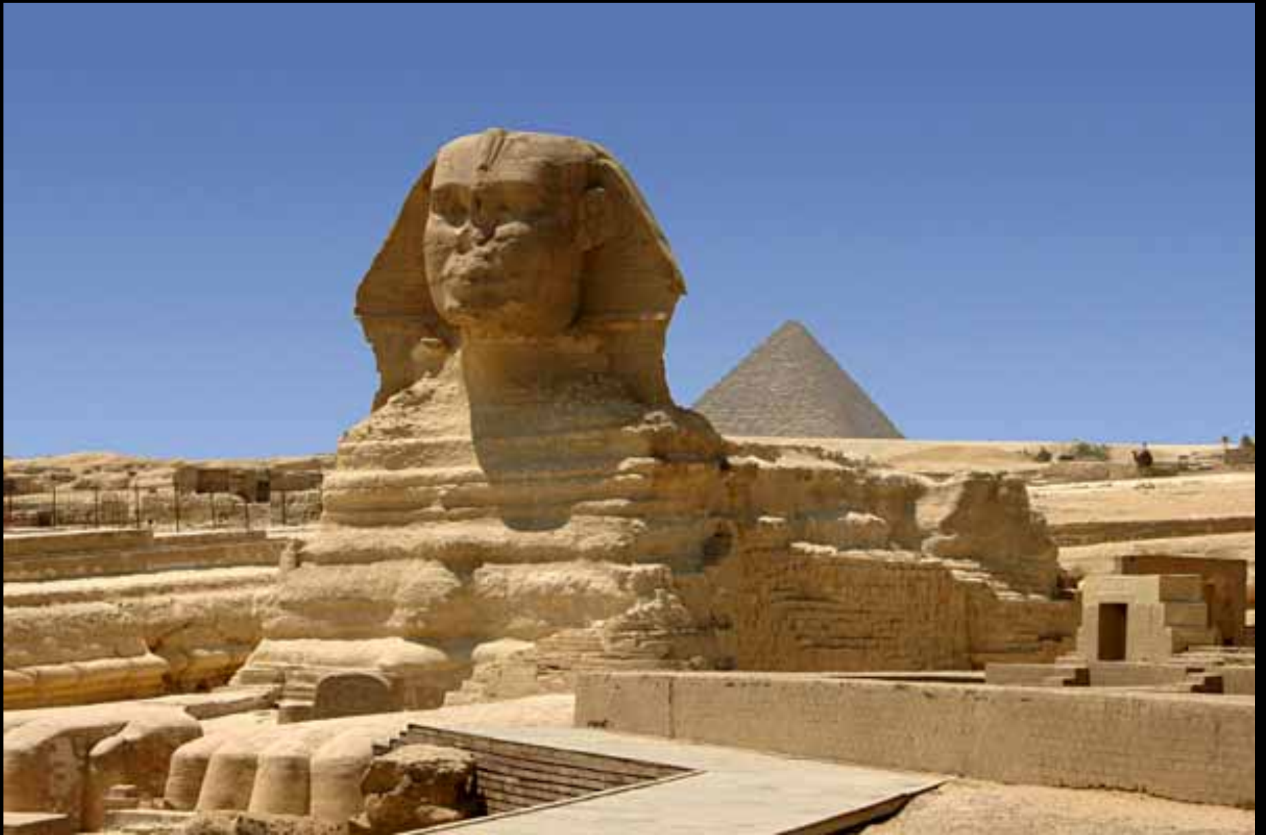
Great Sphinx of Eygpt