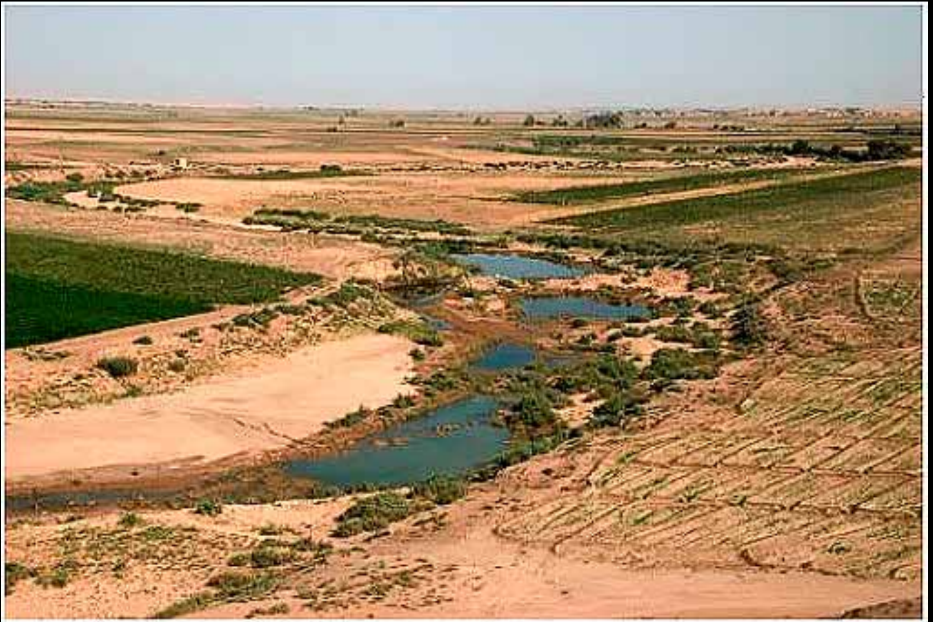
Plain of Shinar/ Dura