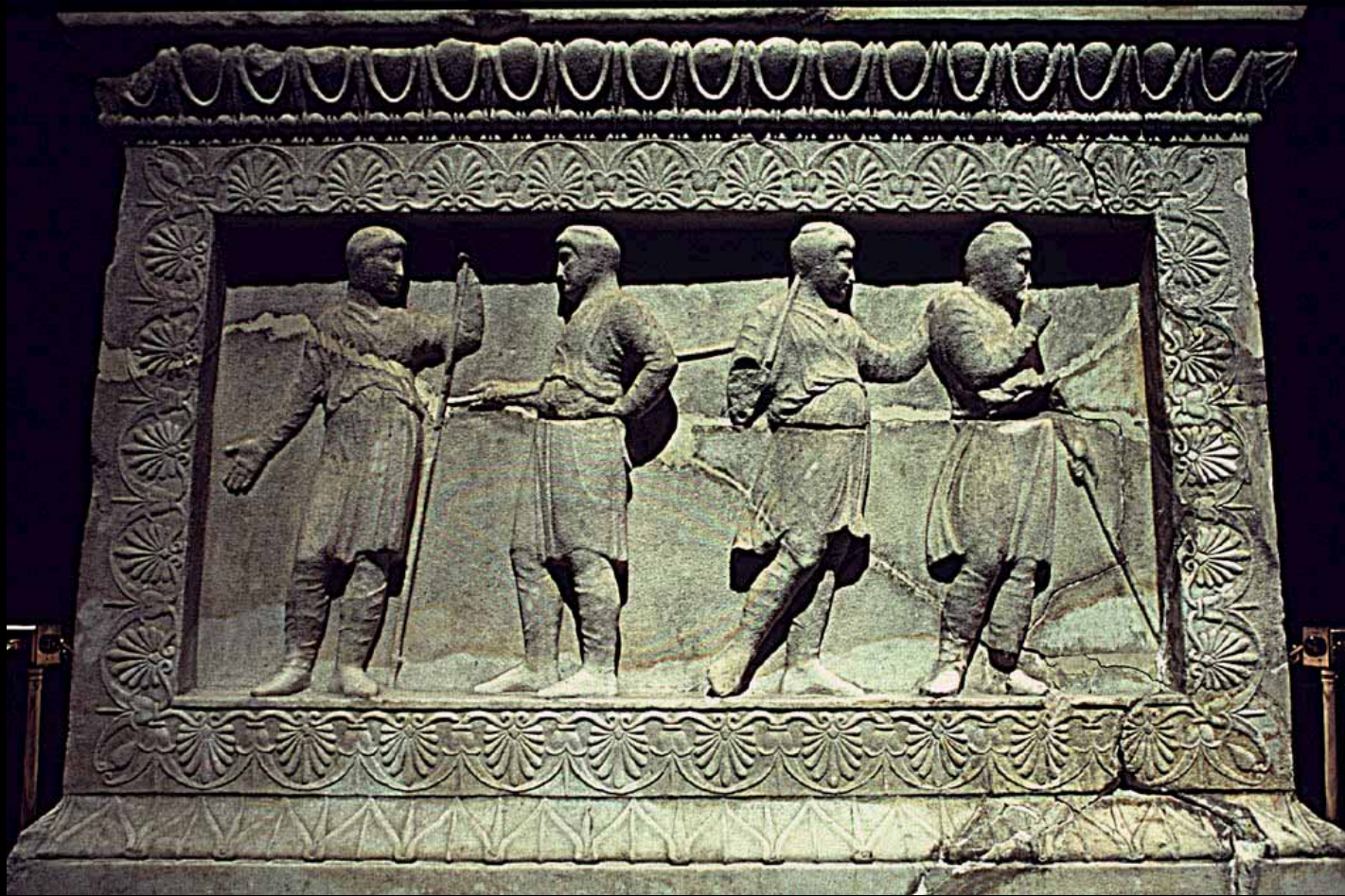
Bas Relief - Satraps