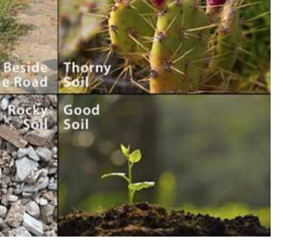
faith produces endurance. James 1:2-3 (NASB)

Consider it all joy, my brethren, when you encounter various trials, knowing that the testing of your