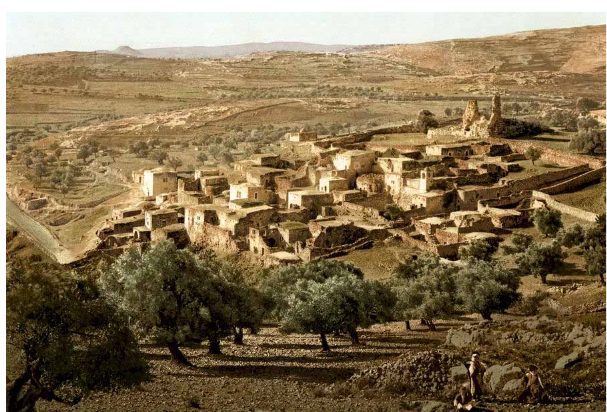
City of Bethany