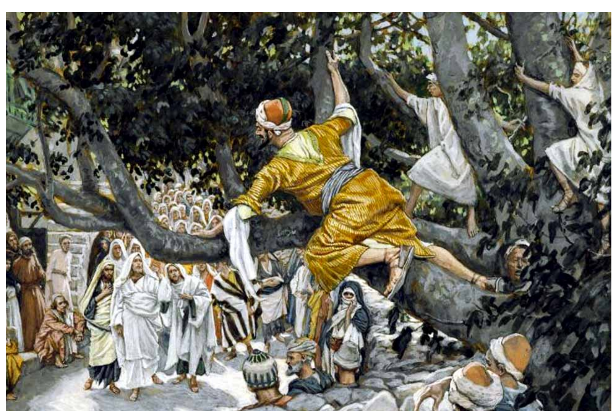
Jesus Met Zaccheus In Jericho