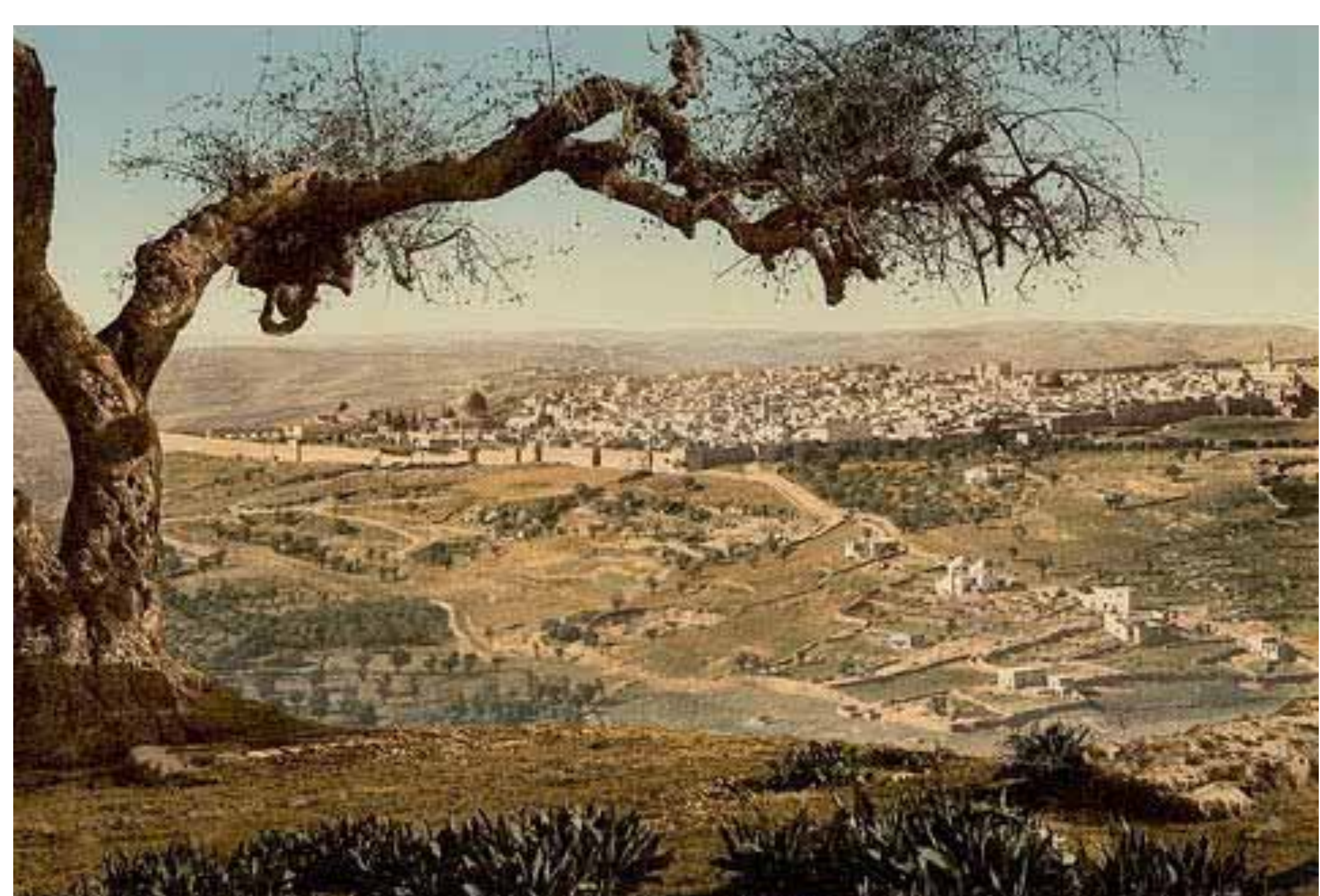
Jerusalem circa 1900