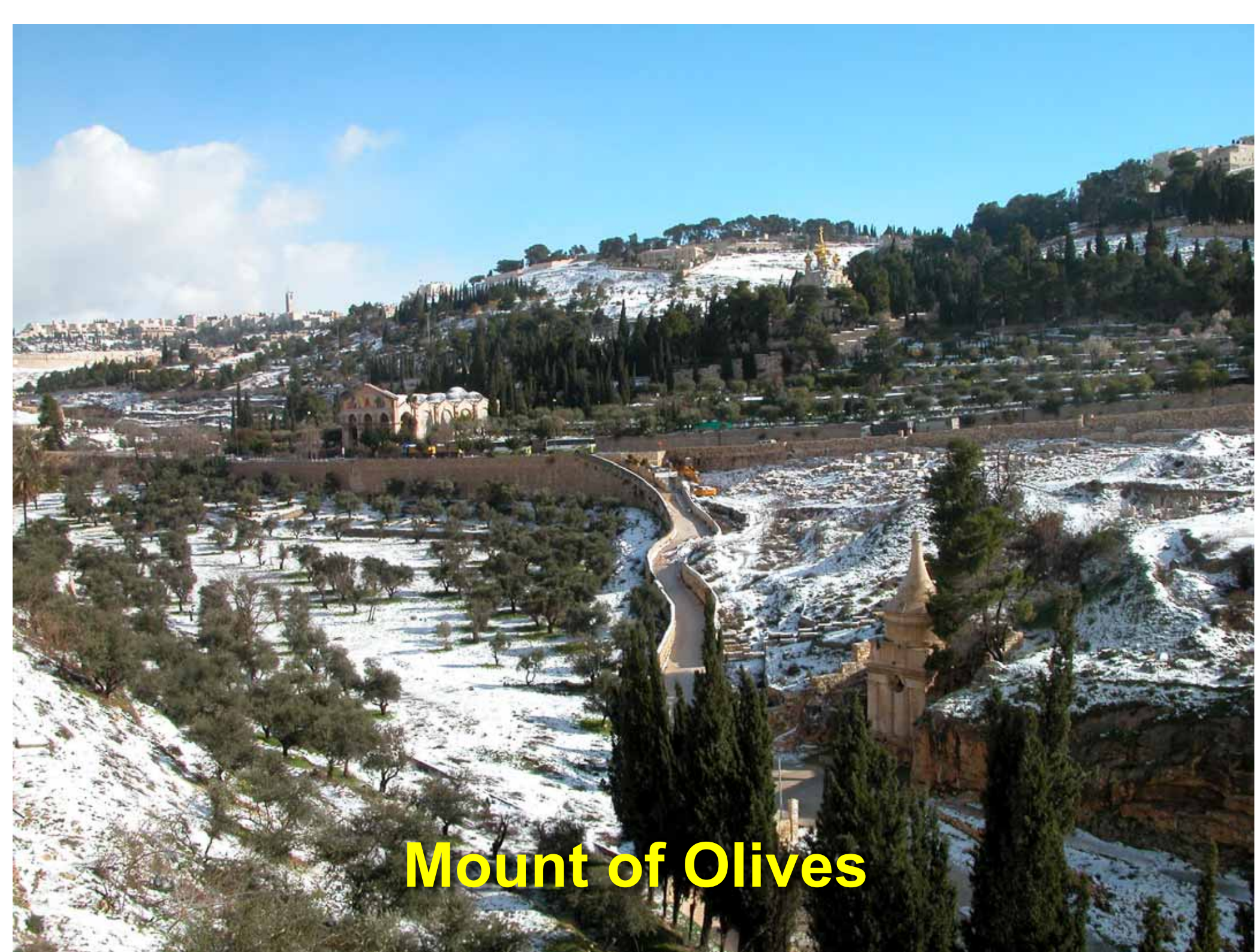
Mount of Olives