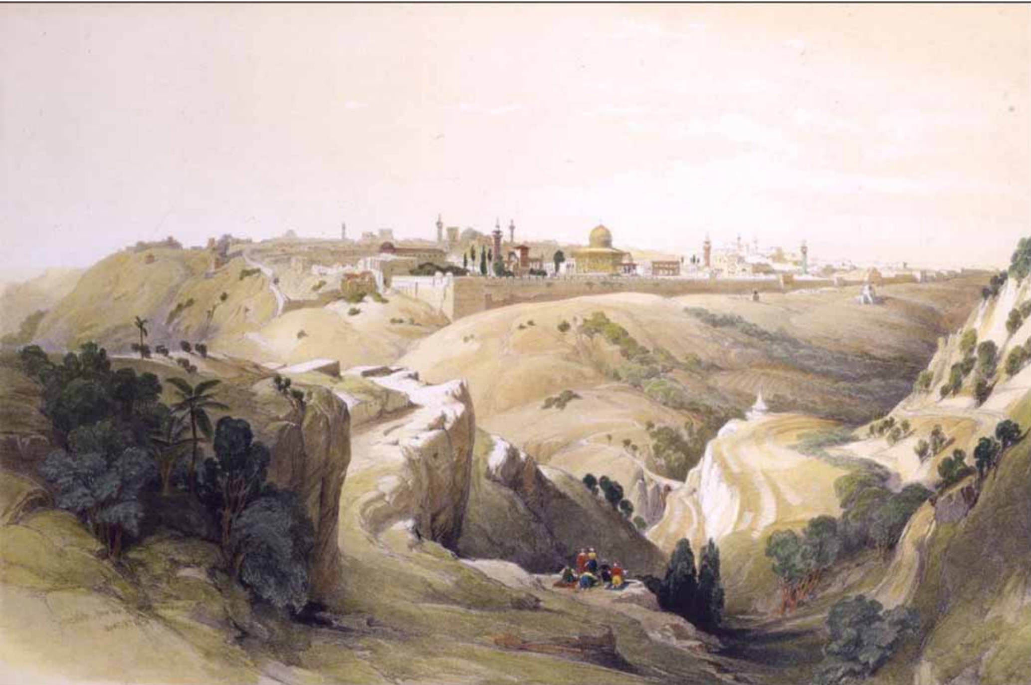
Road From Bethany To Jerusalem - 1833