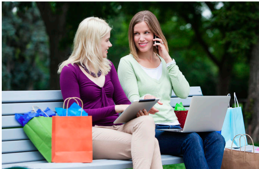
Biblical Modesty For Women by Rachel Calahan

verse again after my study on this subject. I was struck how modesty in a woman does justice, it shows kindness, and it demonstrates if you're walking humbly with your God. What do we mean that it does justice? Simply that it is not fair to behave or to dress in an immodest way in front of a man when he can't stop the arousal of his feelings that you