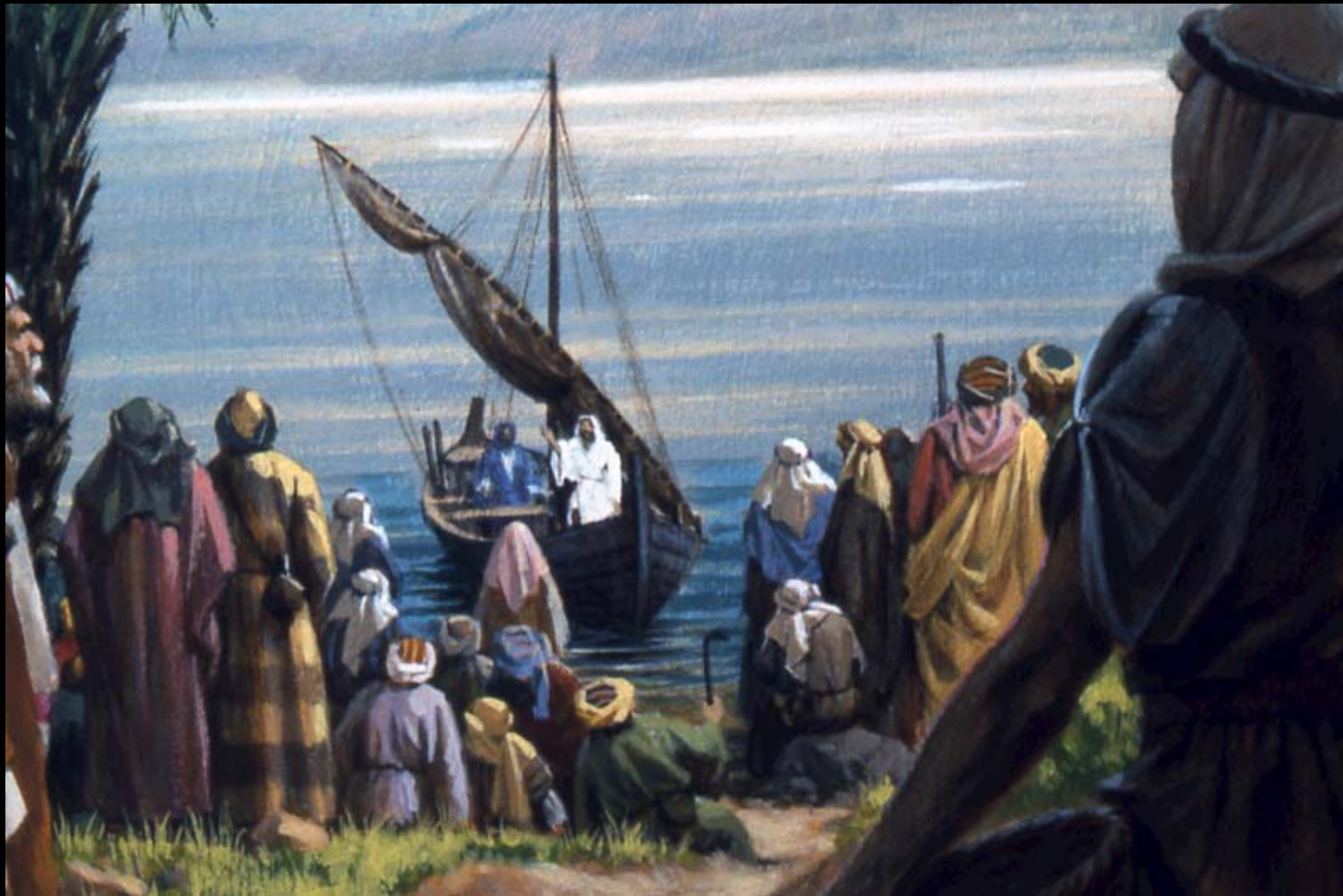
Jesus Preaches From A Boat Luke 5:1-3