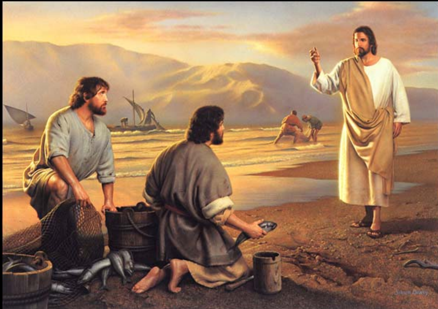
Jesus Approaches Two Disciples Matthew 4:18-22