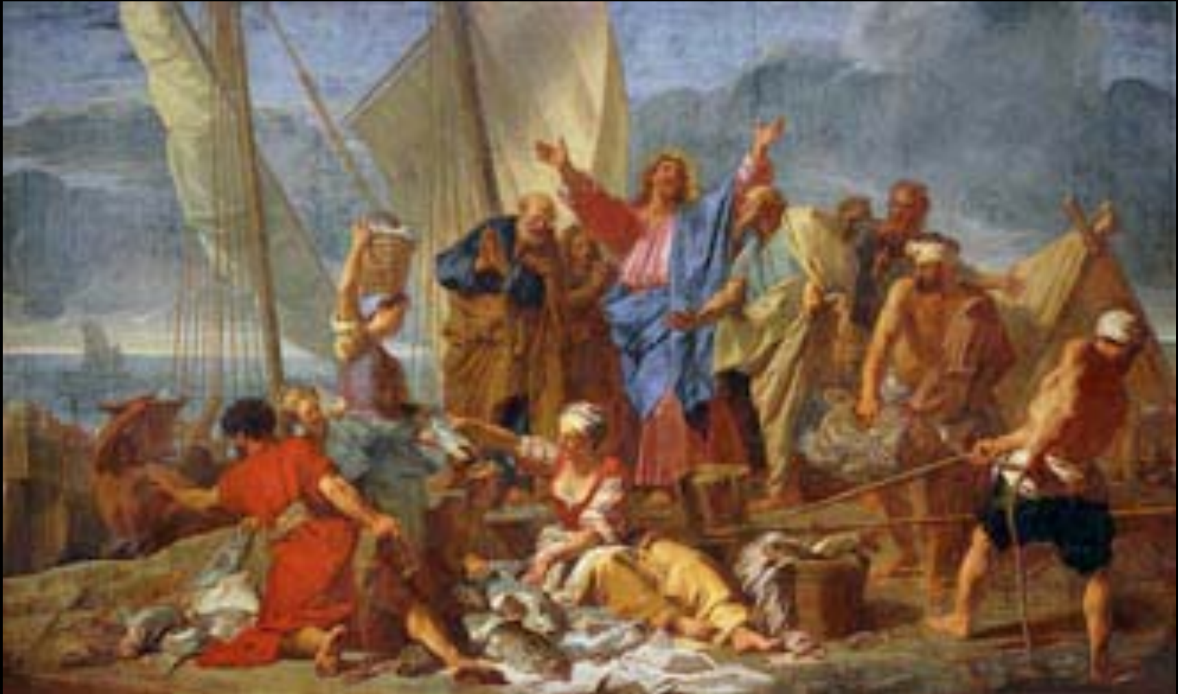
Jesus Pressed By The Crowd Luke 5:1