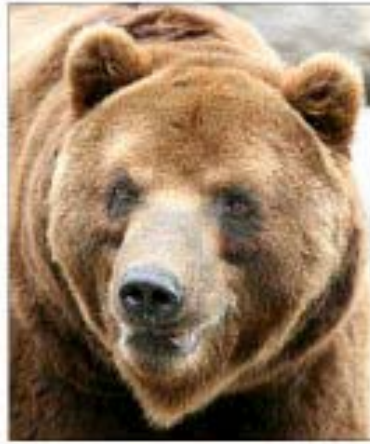
Daniel 7:5 Medo-Persian Empire