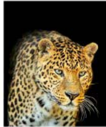
Daniel 7:6 Empire of Greece