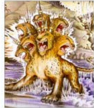
Daniel 7:7 Roman Empire