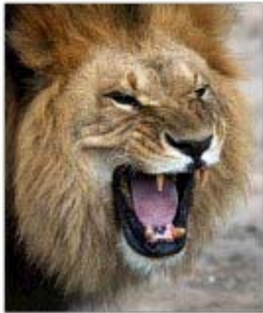
Daniel 7:4 Babylonian Empire