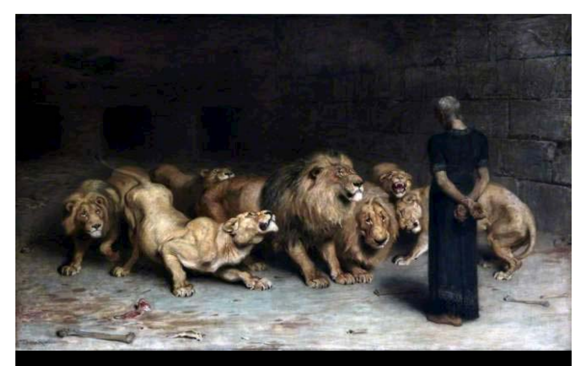
Daniel's In The Lion's Den Dan. 6:6-22