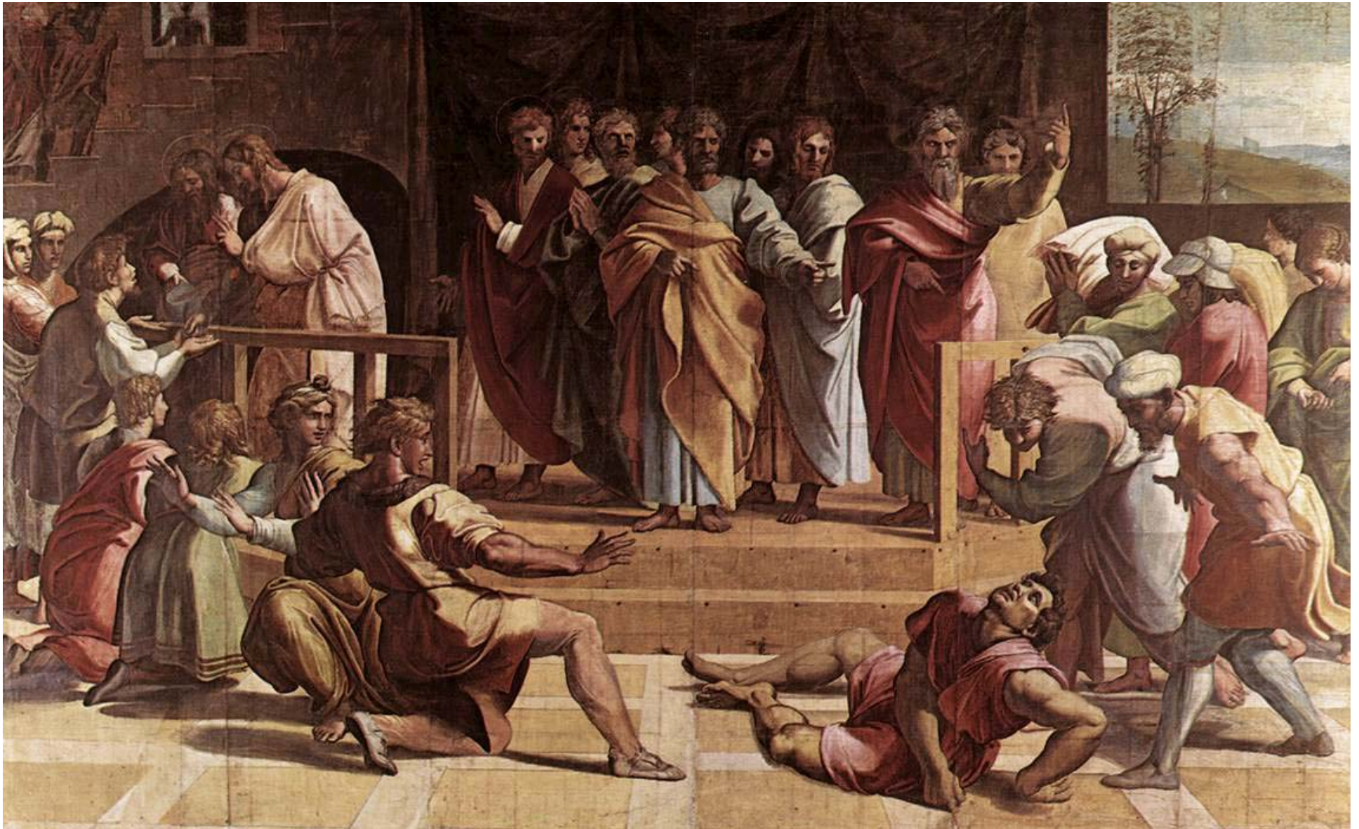
Ananias and Sapphira – Lied & Died