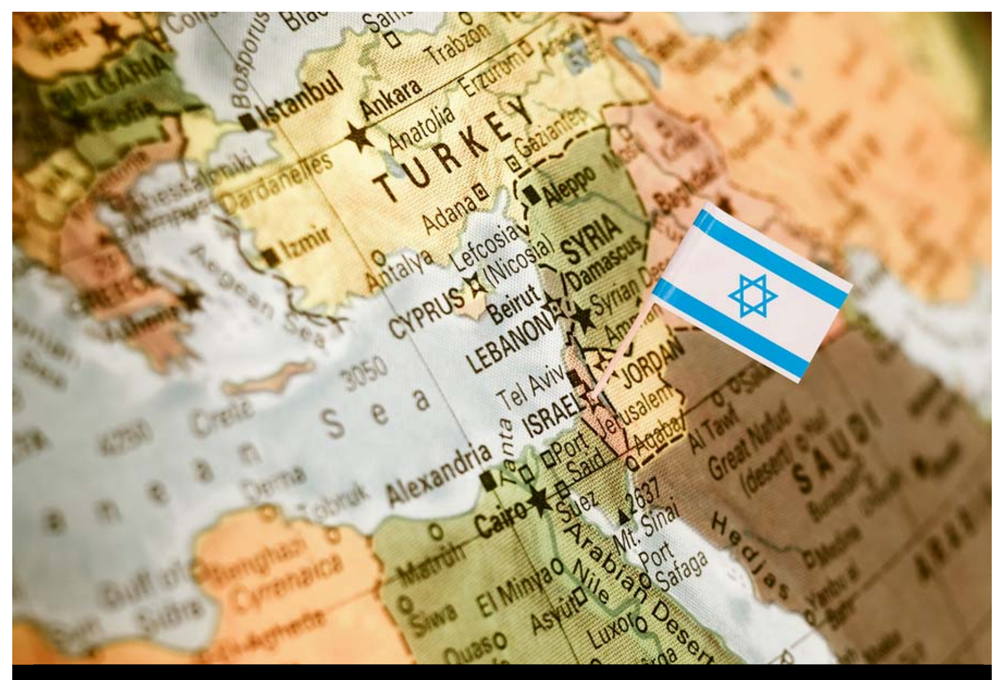
Israel Replaced By The Church?