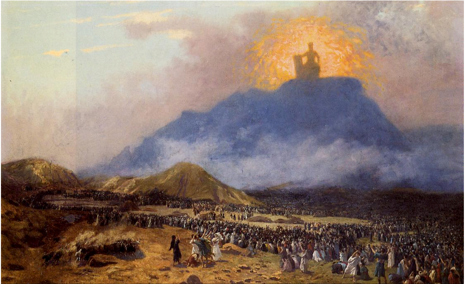
Moses On Mount Sinai With God