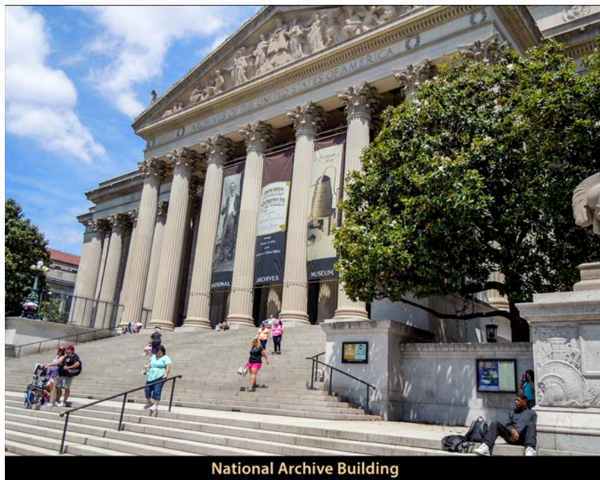
National Archive Building