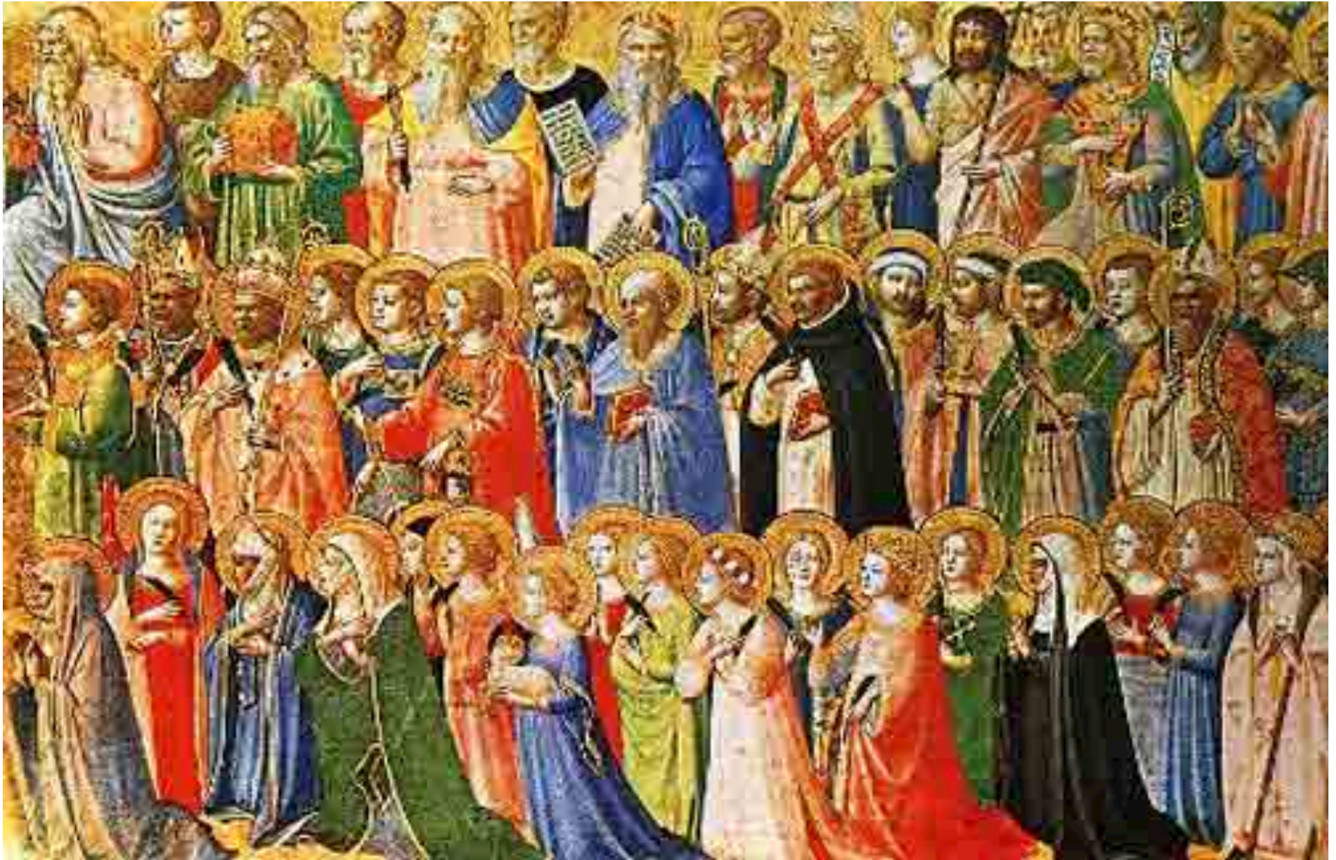
The Old Testament Saints