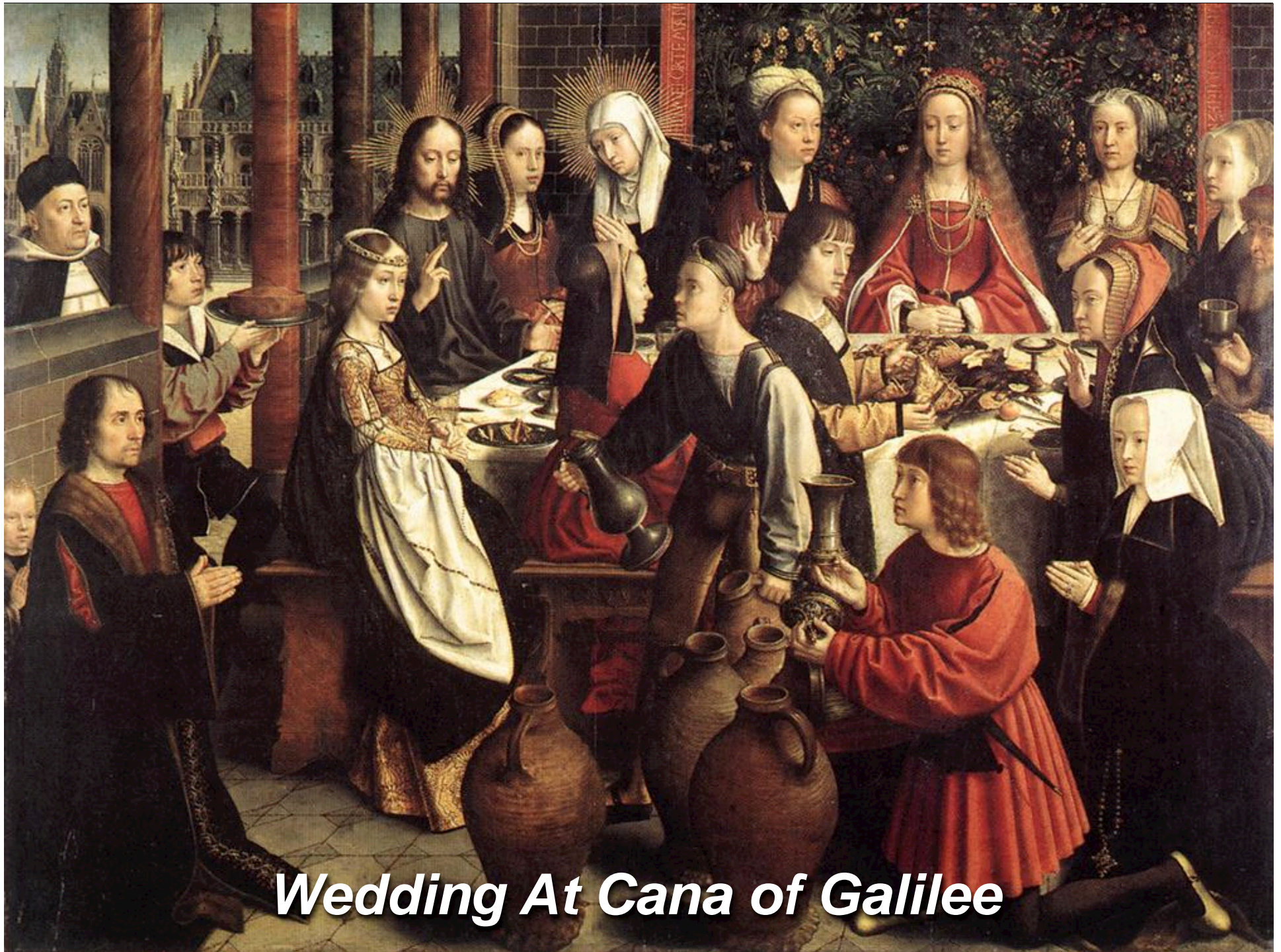
Wedding At Cana of Galilee