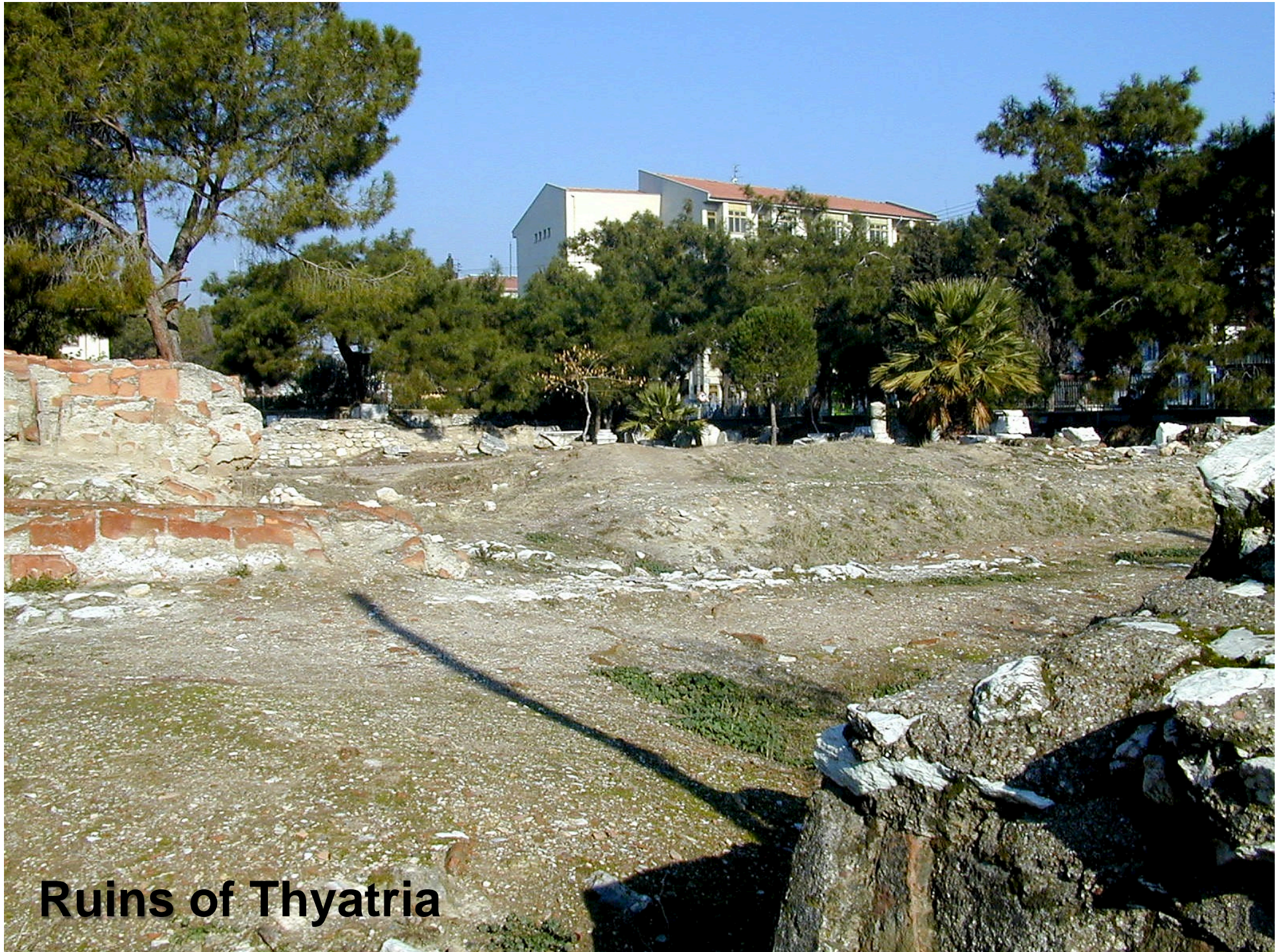
Ruins of Thyatira