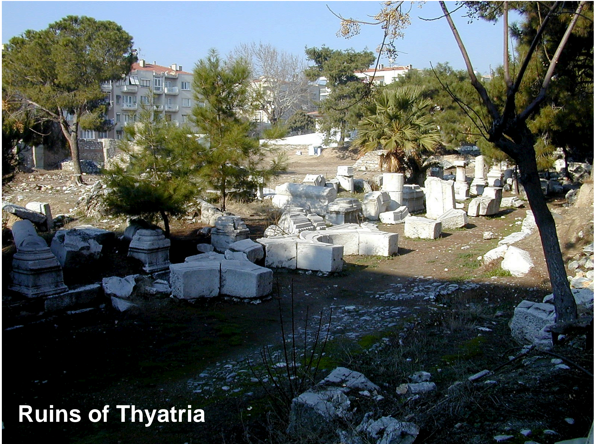
Ruins of Thyatira