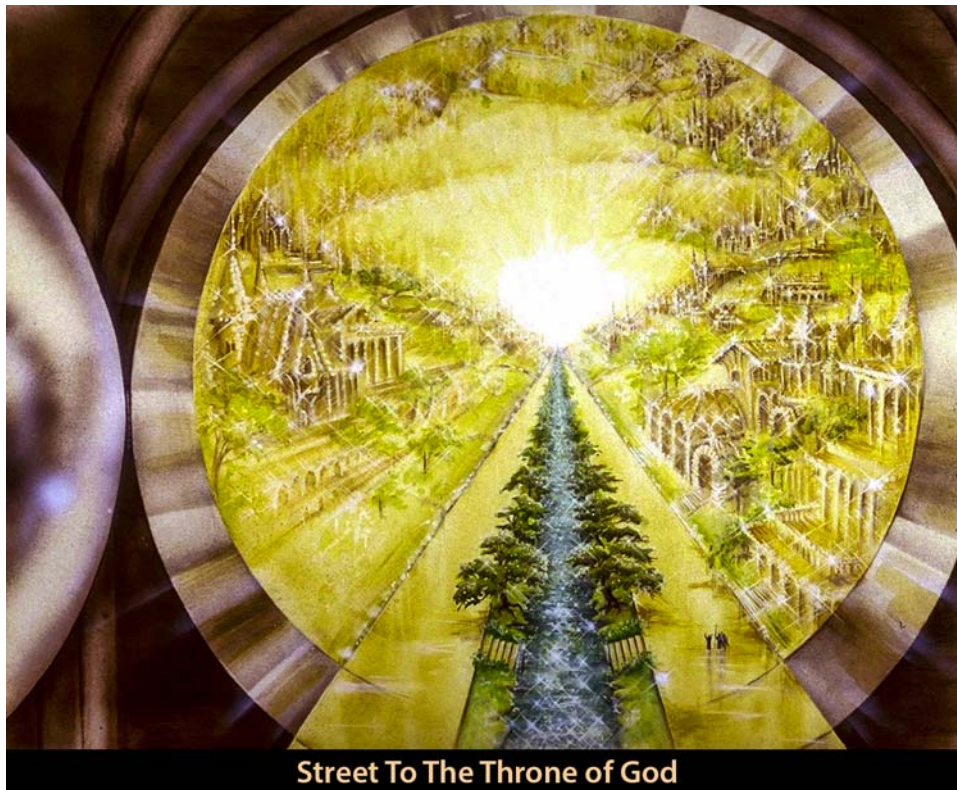
Street To The Throne of God

Blessed are those who wash their robes, so that they may have the right to the tree of life, and may enter by the gates into the city.