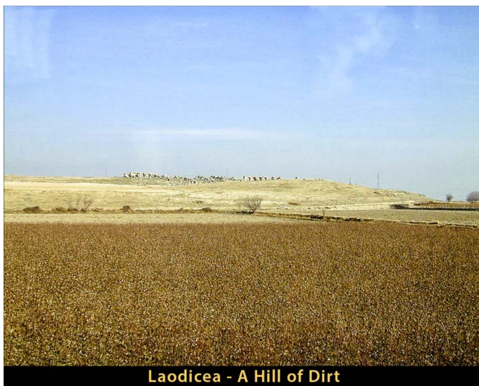
Laodicea - A Hill of Dirt

And to the angel of the church in Laodicea write: The Amen, the faithful and true Witness, the Beginning of the creation of God, says this: I know your deeds, that you are neither cold nor hot; I would that you were cold or hot. So because you are lukewarm,