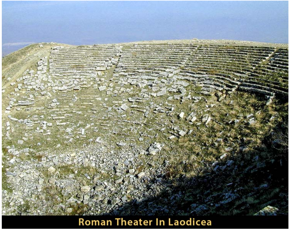
Roman Theater In Laodicea

Those whom I love, I reprove and discipline; be zealous therefore, and repent. (NASB) Rev. 3:19