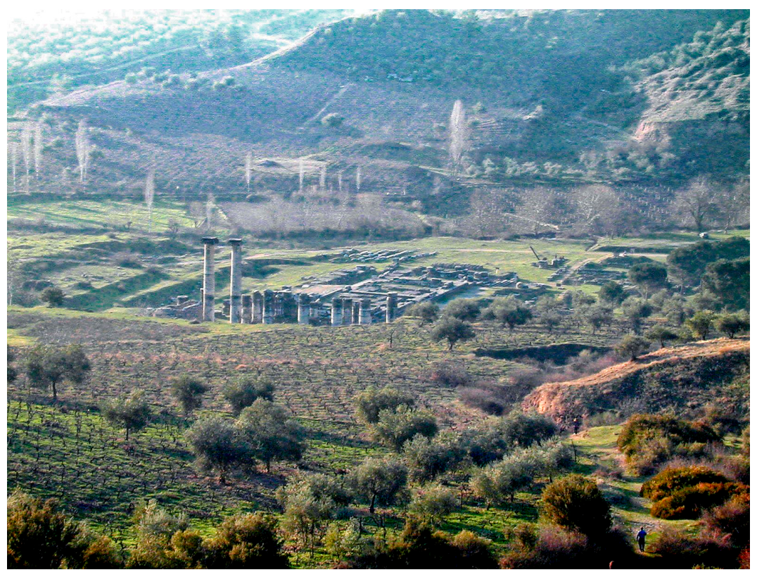
Ancient City of Sardis

I know your deeds, that you have a name that you are alive, but