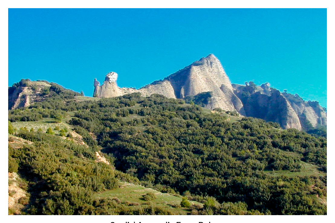
Sardis' Acropolis From Below