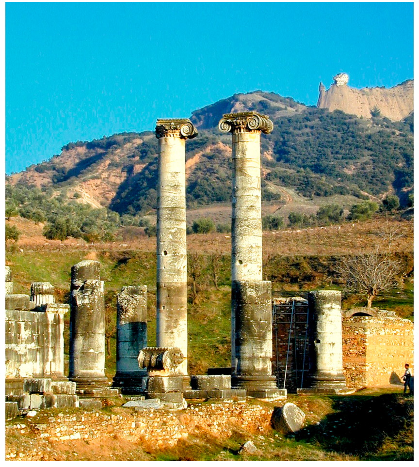
Columns of the Temple of Artemis

Wake up! God warns this church to wake-up. He uses one of five Greek words for "wake-up." The other four have meanings like: "remaining awake while feeling sleepy," "to wake-up in the morning," and "to awake after being asleep." The word for "wake-up" that the Holy Spirit uses means "to remain awake in order to remain alert." They did not know the church was in a hospital and about to die. What should they do? God has the answer.