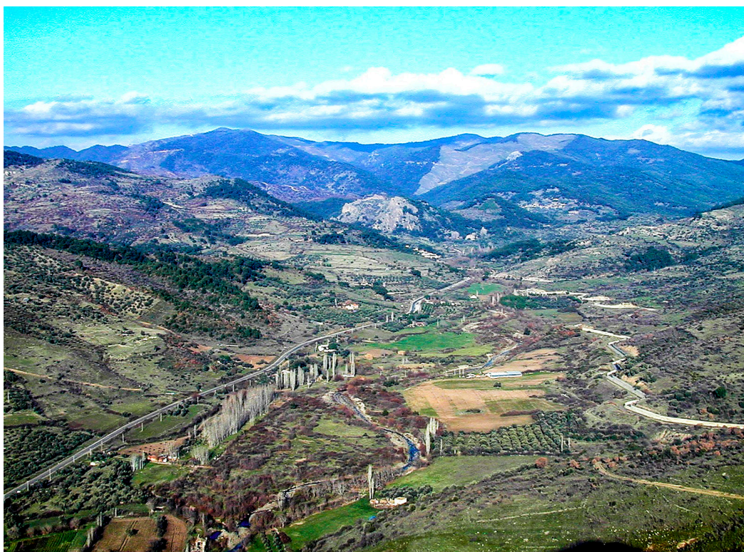
Pergamum River Valley

A famous library was built in the city during the second century by Eumenes II. The library had 200,000 volumes and was a rival of the library in Alexandria, Egypt. In fact, the city was named after the parchment used to make many of the