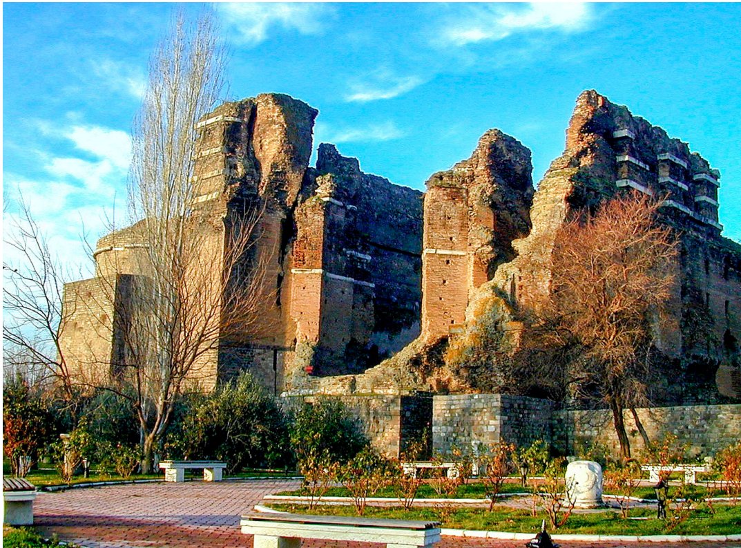
Temple of Serapis