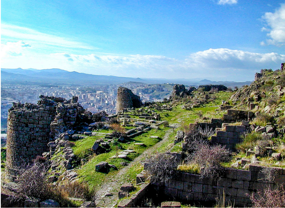
Fortifications of the Acropolis