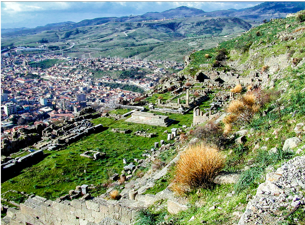
Demeter Sacred Square