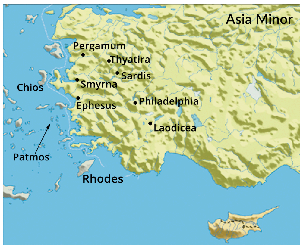
Patmos and The Seven Churches

books. The library was part of Pergamum's culture. But this symbol of pride was given away by Mark Anthony to his "girl friend," Cleopatra, as a gift. The library of Alexandria became even more famous. Today, there are no ruins of this cultural symbol.