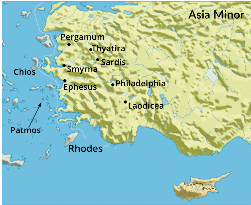
Partmos and The Seven Churches

books. The library was part of Pergamum's culture. But this symbol of pride was given away by Mark Anthony to his "girl friend," Cleopatra, as a gift. The library of Alexandria became even more famous. Today, there are no ruins of this cultural symbol.