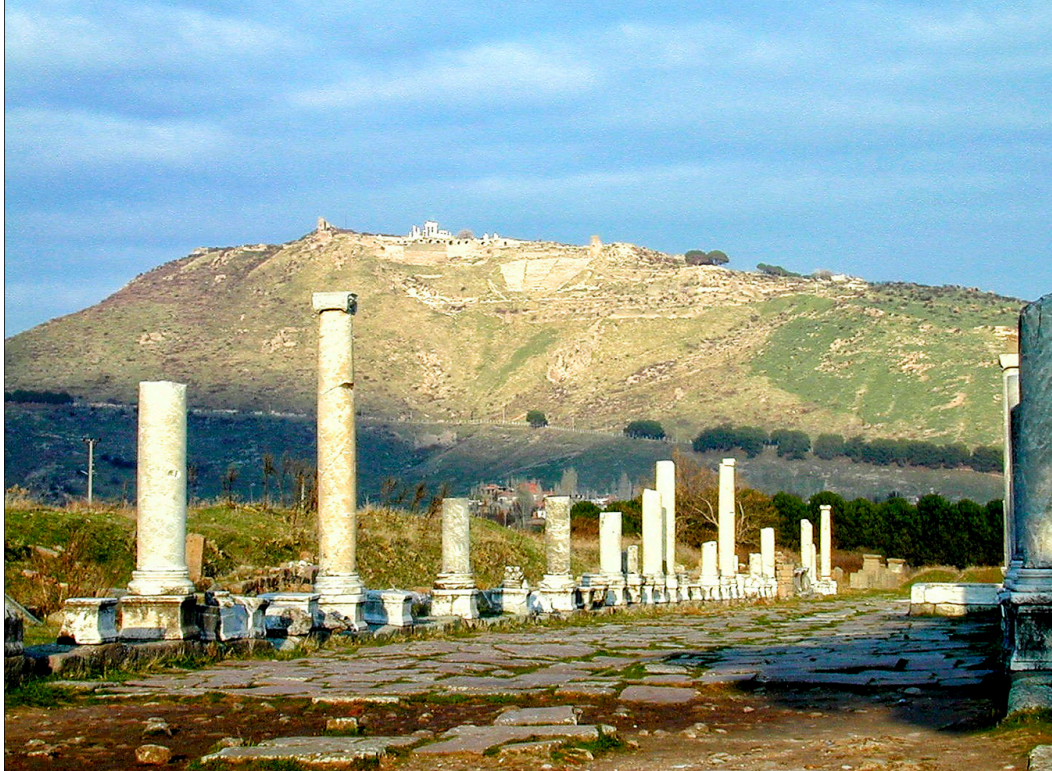
Sacred Way To The Acropolis