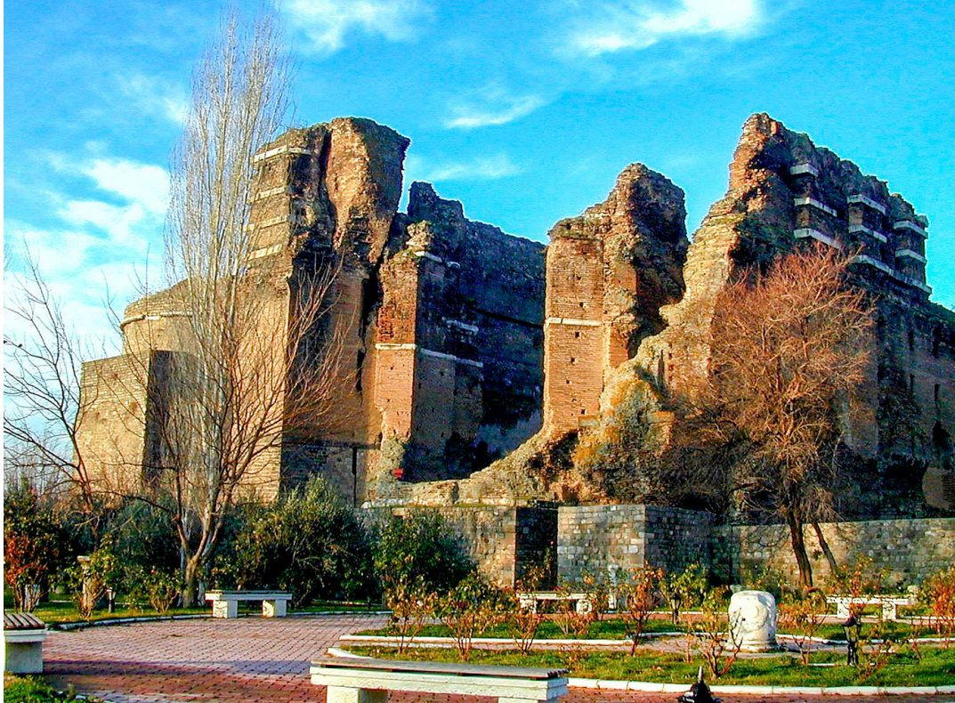
Temple of Serapis