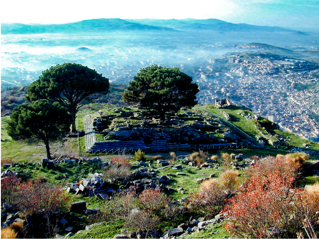
Temple of Zeus