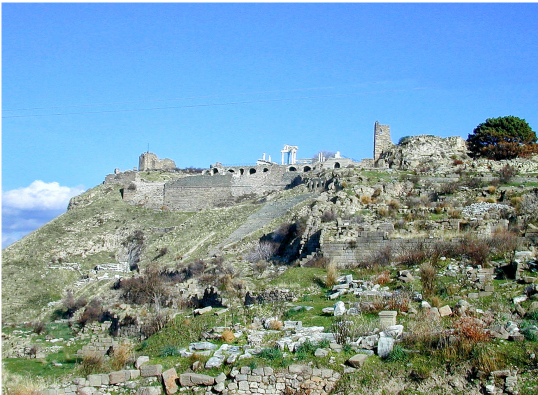
Pergamum Acropolis and Theater