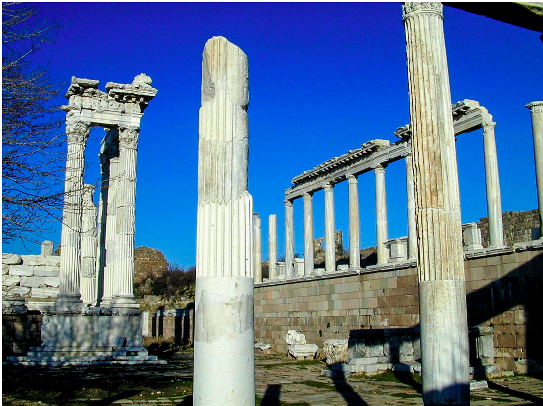
Temple of Trajan