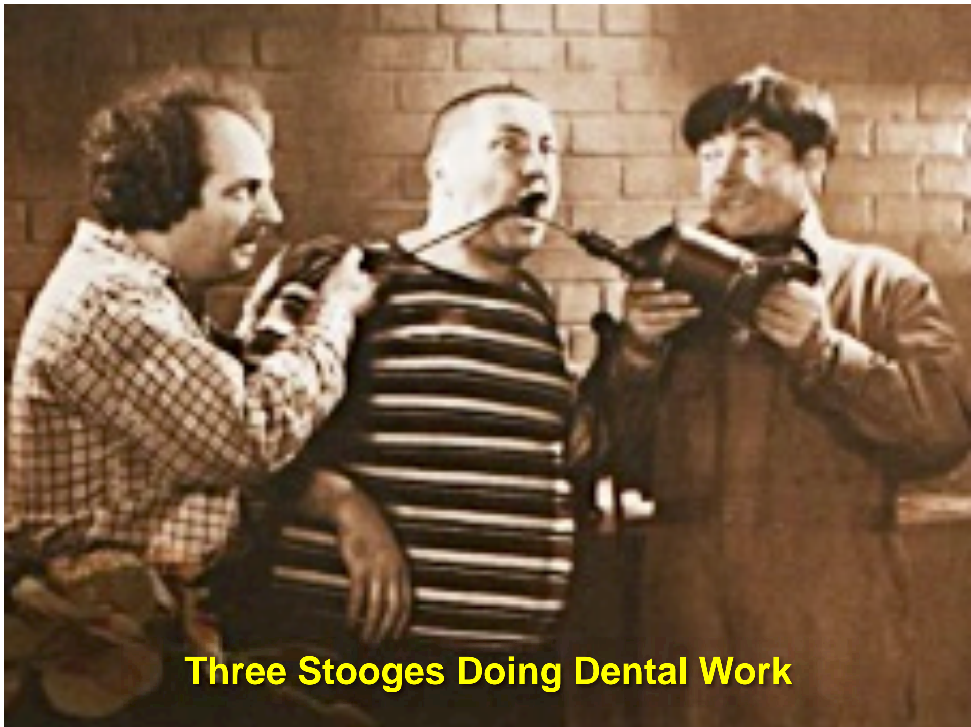
Three Stooges Doing Dental Work