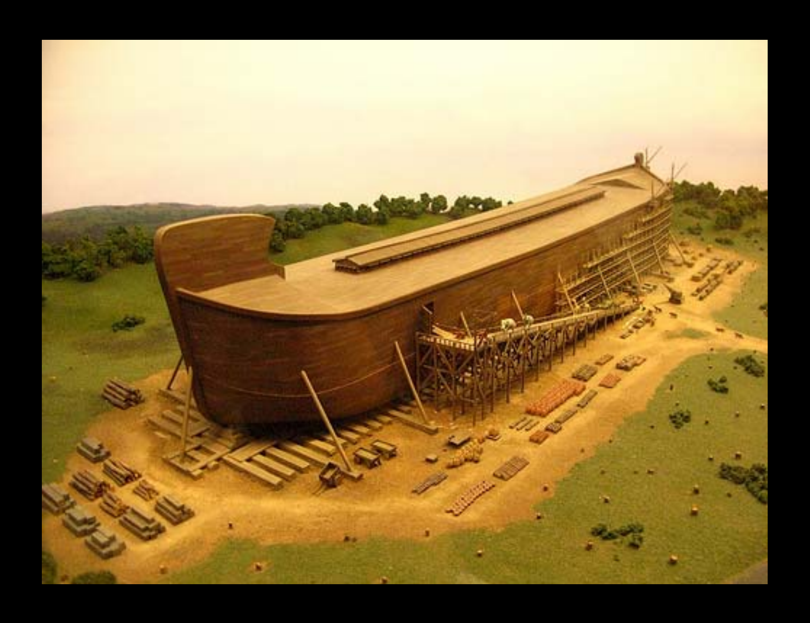
Answers In Genesis Concept of Ark