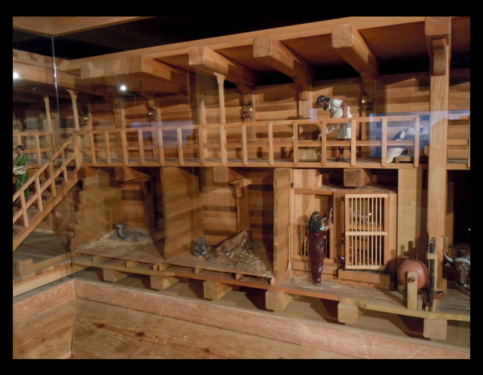
Answers In Genesis – The Ark