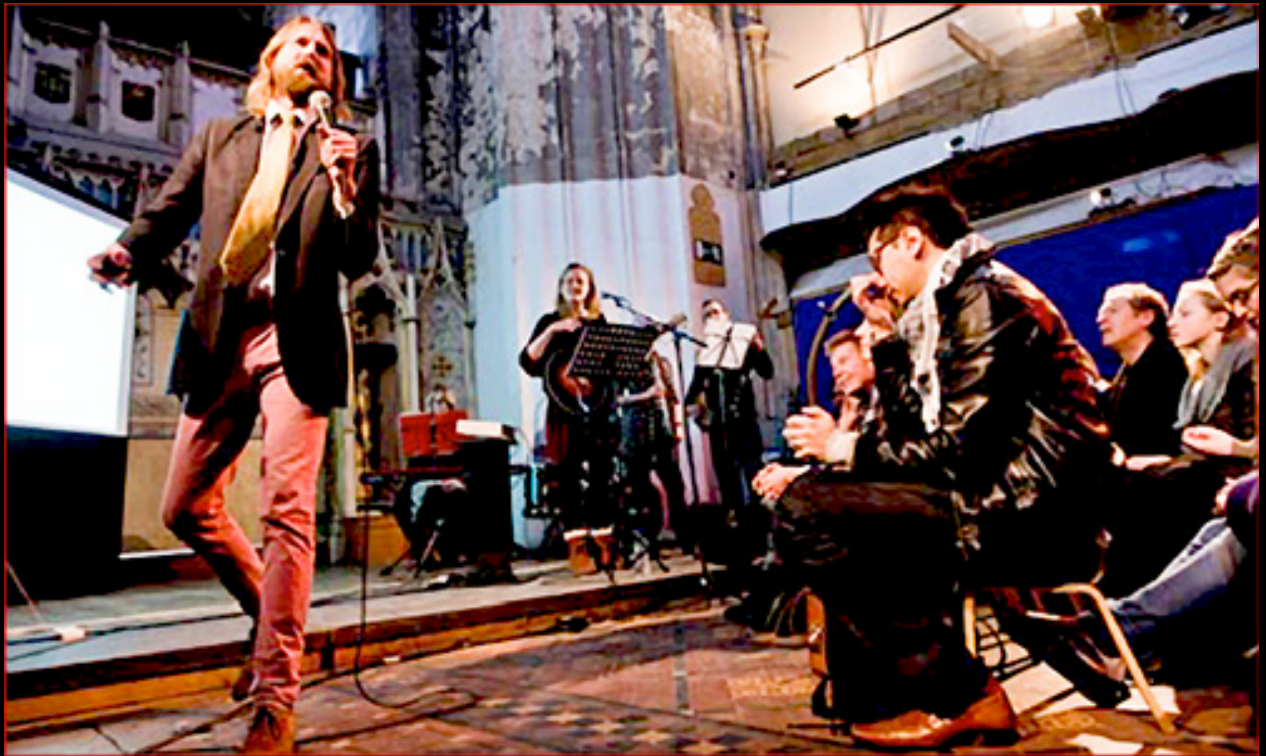
First Meeting of Sunday Assembly