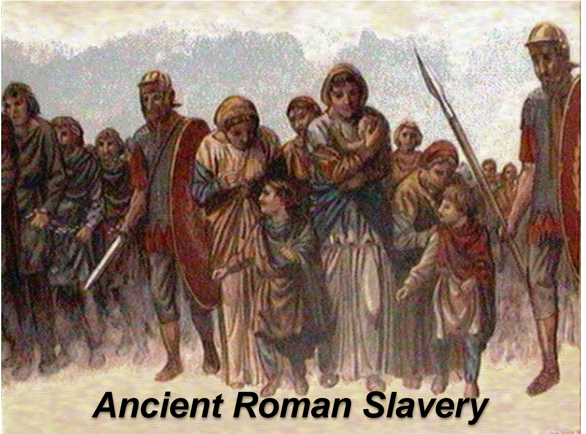
Ancient Roman Slavery