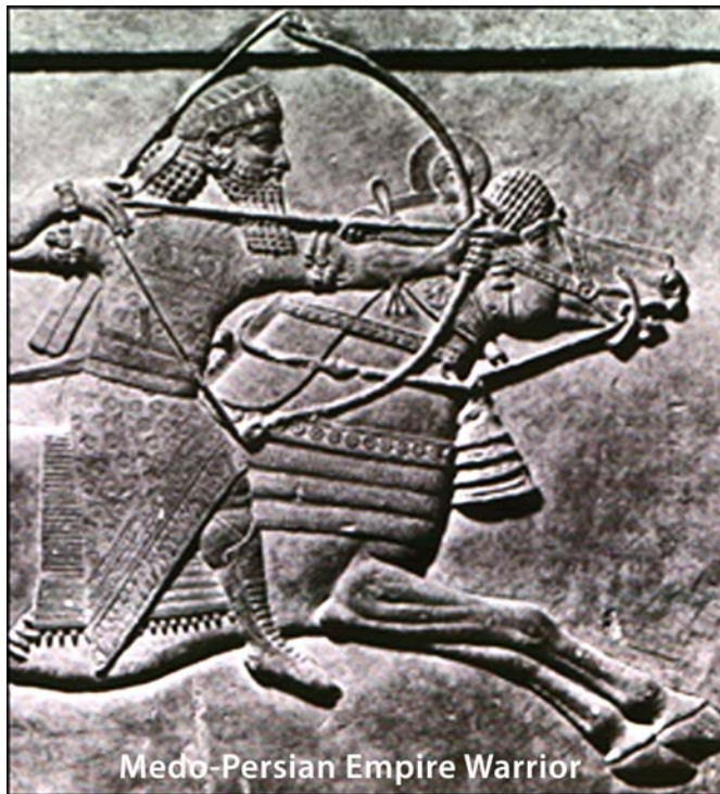
Medo-Persian Empire Warrior

Then these men said, "We shall not find any ground of accusation against this Daniel unless we find it against him