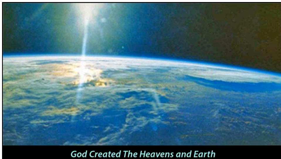
God Created The Heavens and Earth

In another Hindu creation story, the God of the sky commits incest with his daughter and spills his seed on the ground.