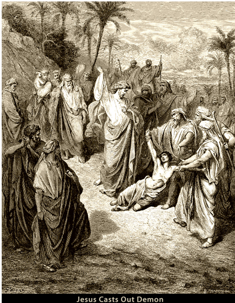
Jesus Casts Out Demon

On the next day, when they came down from the mountain, a large crowd met Him. Luke 9:37 (NASB)