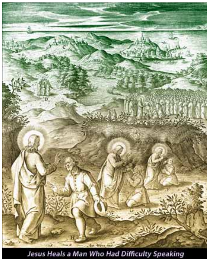
Jesus Heals a Man Who Had Difficulty Speaking

Jesus' second action was a simple touch. He put His fingers into the man's ears. Jesus did not care about wax build up in the man's ears. Jesus did not ask if the man had bathed recently. Jesus did not put on gloves. He just put His fingers into the man's ears. Why did Jesus do that? The answer is found in the question, "How does one communicate to a man who cannot hear you?" By putting His fingers into the man's ears, Jesus was drawing the man's attention to his ears. Jesus was communicating to the man, "I am going to do