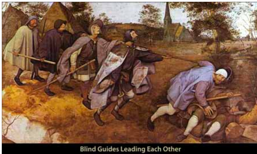
Blind Guides Leading Each Other

But He answered and said, “Every plant which My heavenly Father did not plant shall be uprooted. Let them alone; they are blind guides of the blind. And if a blind man guides a blind man, both will fall into a pit.” Matt 15:13-14 (NASB)