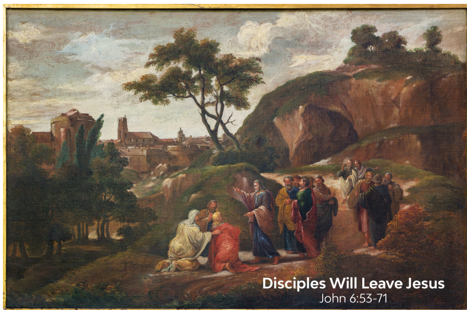
Disciples Will Leave Jesus John 6:53-71

For those who were standing there and listening, we can understand why this was diffi-