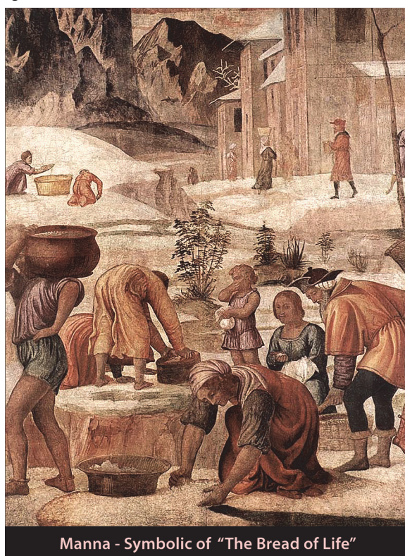
Manna - Symbolic of “The Bread of Life”

BREAD WHICH CAME DOWN OUT OF HEAVEN. Next, Jesus must have pointed to Himself when He said,