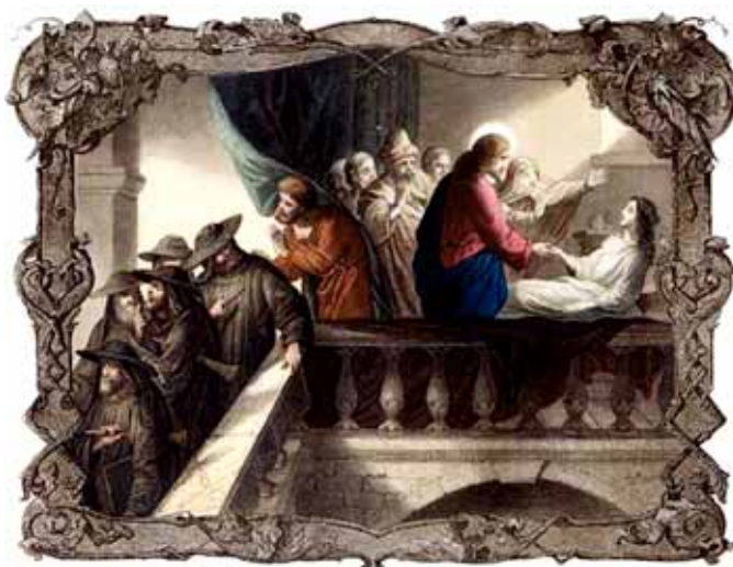
Jairus' daughter being raised from the dead

And her spirit returned . . . (NASB) Luke 8:55a