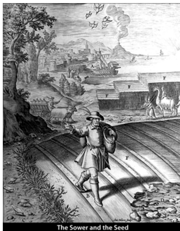
The Sower and the Seed

The Old Testament saints and prophets had longed to know about Jesus and to see Him. They would have loved to have been present. Even the holy angels had longed to know more about Jesus (1 Peter 1:10-12). The disciples were privileged. They could see with their eyes, hear with their ears, and touch the Son of God.