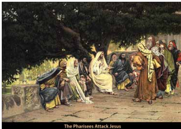
The Pharisees Attack Jesus

The gospels directly and honestly state that Jesus was accused by the religious leaders of performing His miracles by the power of Satan. Is it a surprise that Matthew and