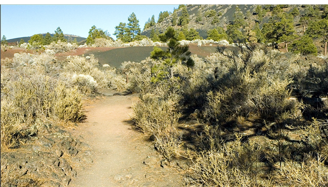
The Narrow Road