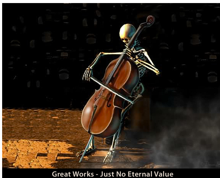
Great Works - Just No Eternal Value

The priests were being partial in their instruction. Were they seeking to please the people? What is clear is that they were not teaching all of scripture. The priests were teaching only parts of the Bible. This is a problem with topical preaching. It can and usually does ignore major sections of the Bible.