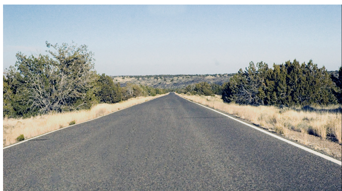
The Wide Road

Have you ever wondered if you are a Christian? Do you wonder if you are going to heaven? Or, maybe you think you are walking on the narrow road already! Verse 14 warns us that