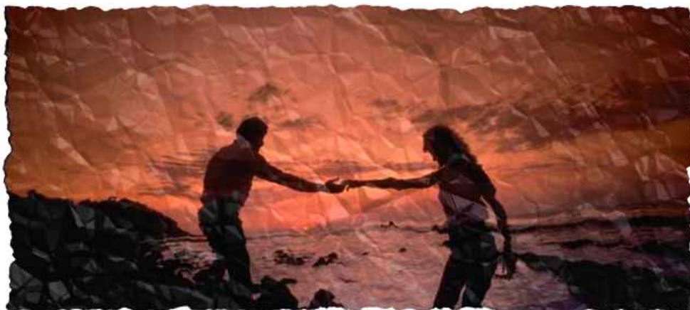
Divorce - A Shattered Marriage is Not God's Plan

IT WAS SAID. The religious leaders of His day did not value marriage, but God did. So Jesus said,