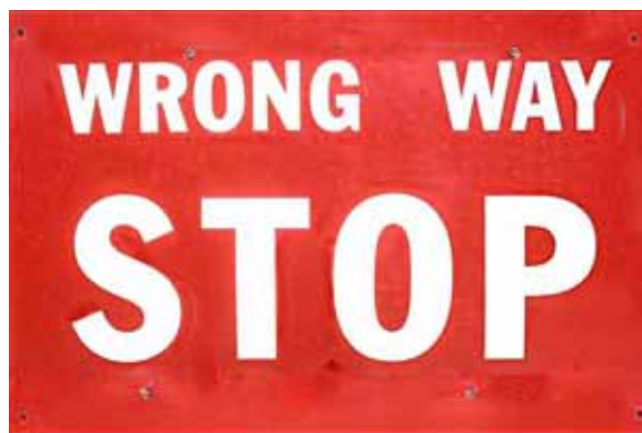
Is Your Divorce a Biblical Divorce?

The last reason was given to me some years ago by a young woman who felt rejected by her husband. She claimed to be a Christian. So when I asked her why she believed that it was okay to leave her husband, she said that 1 Cor. 7:12-15 gave her permission to divorce him. Here is the passage she referred to.