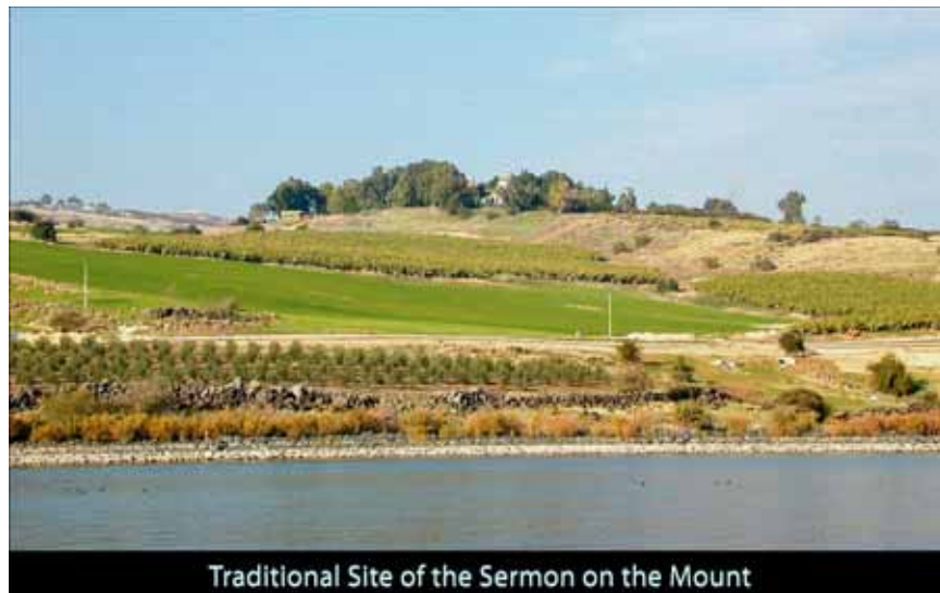
Traditional Site of the Sermon on the Mount

have other issues to deal with in their life. Jesus was not talking about someone who is always unhappy and upset with their lives. He was not referring to those who have suffered the loss of a loved one. Mark 16:10 tells us the disciples mourned