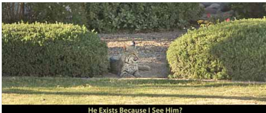
He Exists Because I See Him?

The Greek word in Matthew 4:12 which is translated as "withdrew" really has the idea of "escape." That is, Jesus left