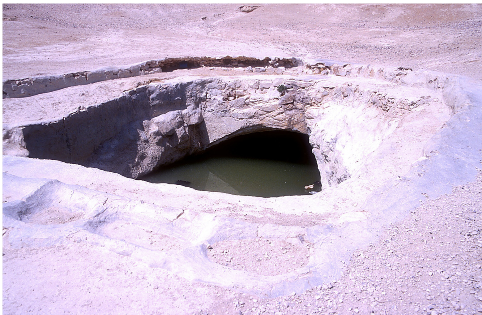
Waterhole In the Judean Wilderness