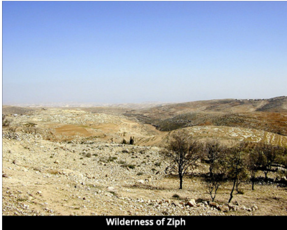
Wilderness of Ziph