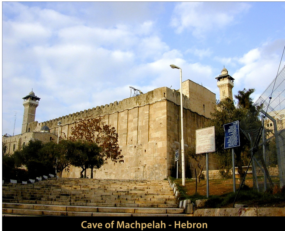
Cave of Machpelah - Hebron

Thousands of years earlier Abraham, the great patriarch to the Jews, knew that Jesus was to come and why He was to come. It is wonderful, although not surprising, that Zacharias includes Abraham in his prophecy because the Jews traced their lineage back to him through his son Isaac. The Arabs trace their lineage back to Abraham through Ishmael, Abraham's other son. The promise that God made to Abraham was a significant one because it was about Jesus,