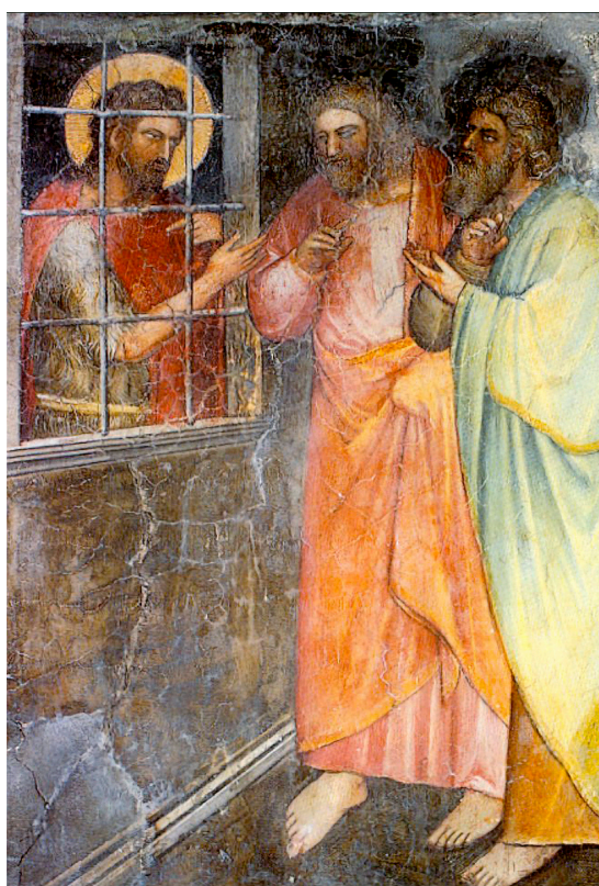
John the Baptist In Prison

After John’s disciples were some distance away, Jesus asked the crowds, “What did you go out into the wilderness to see? A reed shaken by the wind?” The Greek word that Jesus used for “to see” comes is theaomai . The word refers “to observing closely something that is very unusual.” Jesus knew