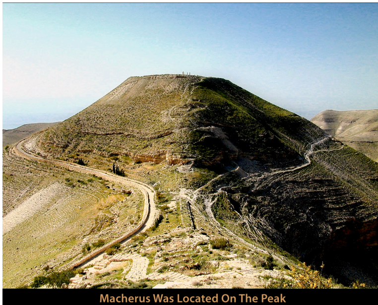
Macherus Was Located On The Peak

Behold, I am going to send My messenger, and he will clear the way before Me . . . Malachi 3:1a (NASB)