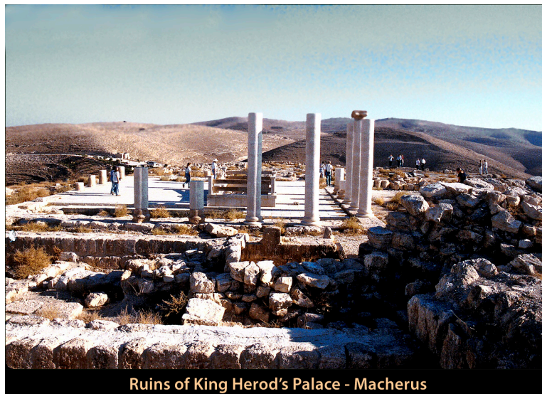
Ruins of King Herod's Palace - Macherus

(Matthew 4:12; Luke 3:19-20). John had rebuked Herod for committing adultery with his brother's wife Herodius. Historians tell us that King Herod had an affair with Herodius while he was away in Rome. When he returned home, Herod divorced his wife and married Herodius. In response John had publicly denounced Herod.